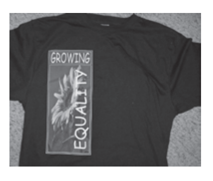
Equinox T-Shirts 2008: "Growing Equality" $25.00 each.