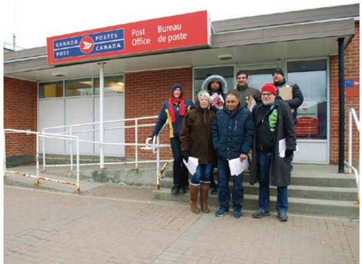
Members of the CUPW Edmonton Local Executive stage an information picket at the St. Albert Post Office the morning of Thursday, March 17th to inform the public and oppose it's proposed closure.