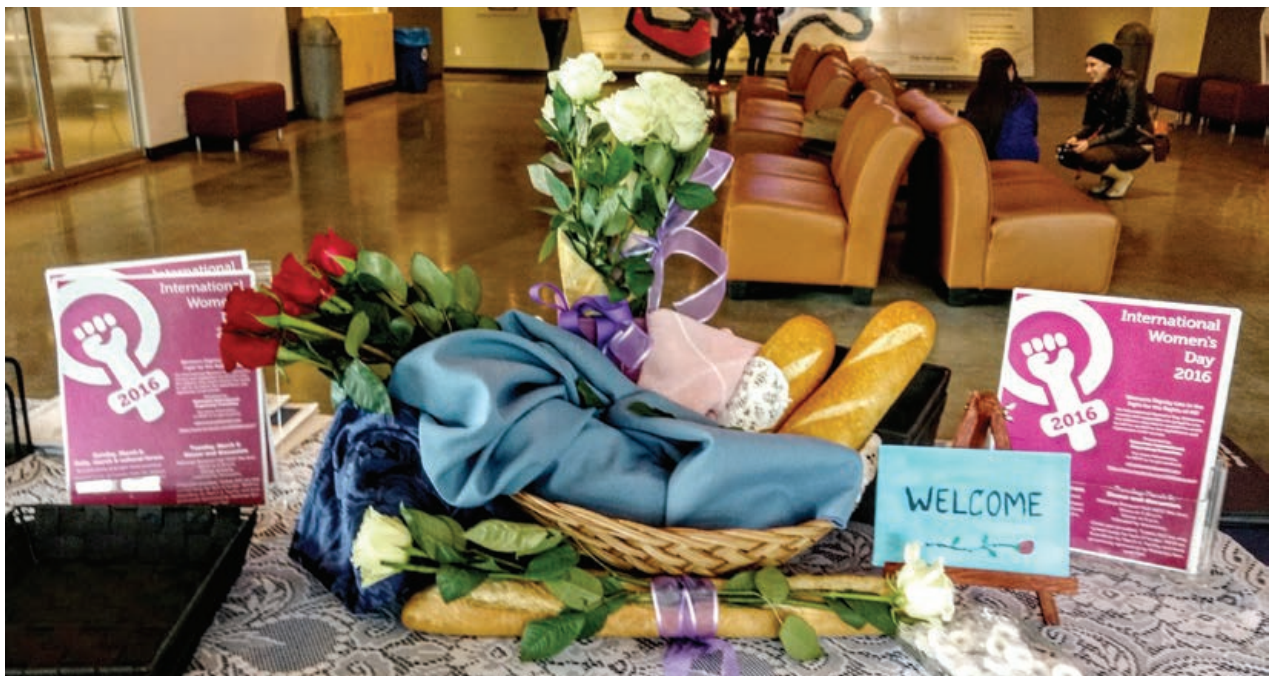
International Women's Day 2016

Next Women's Committee Meeting: Thursday April 7, 6:30 - 8:30pm, Union Office (Discussion of Planning of Annual Equinox Event tentatively set for September)