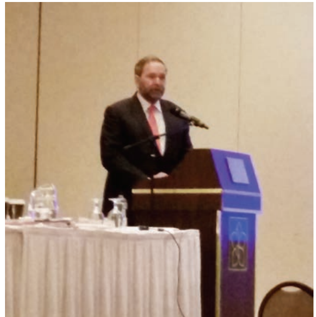
Tom Mulcair encourages postal workers at the March 2016 Spring School